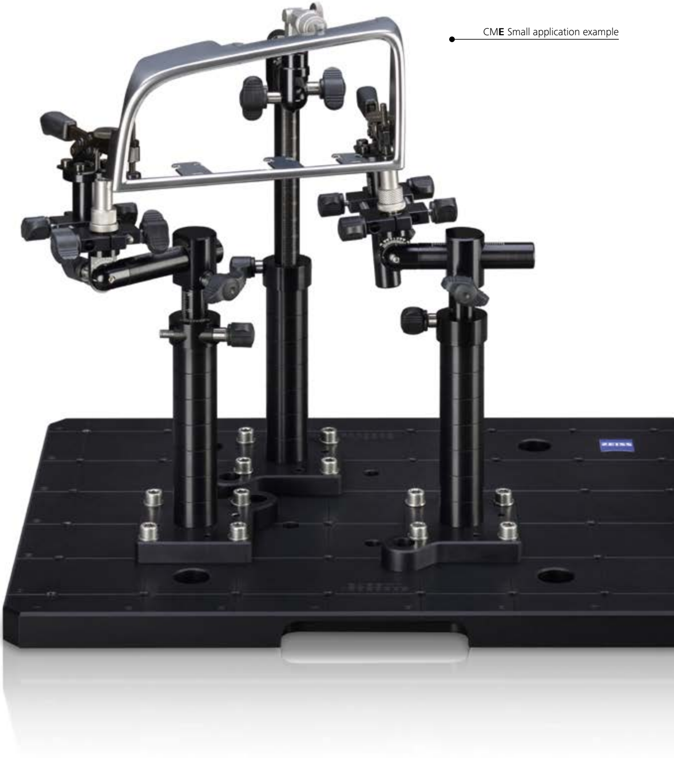
CME Small application example