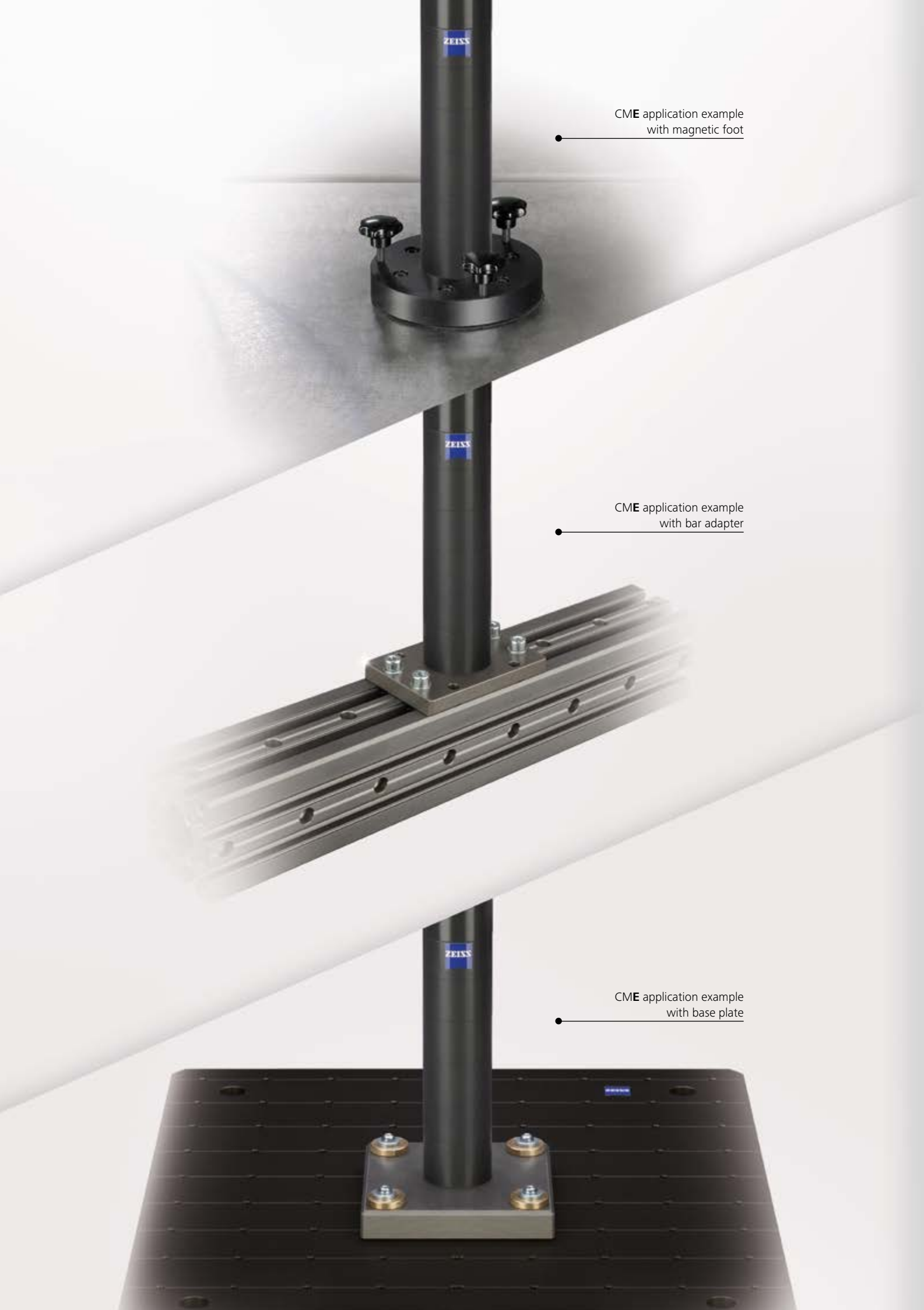
CME application example with magnetic foot